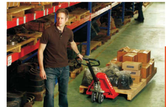
Hand Pallet Truck